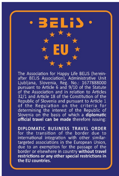
Zadnja stran diplomatske akreditacije: