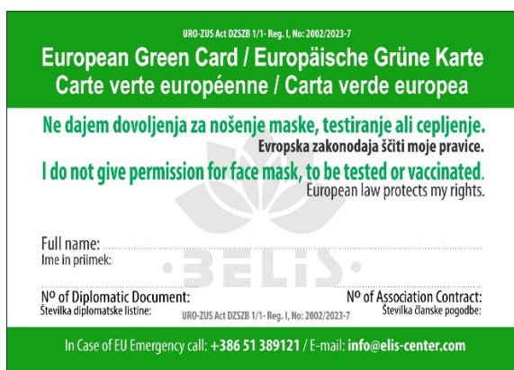
Zadnja stran delegatske akreditacije: