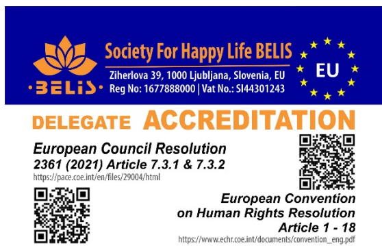
Sprednja stran delegatske akreditacije: