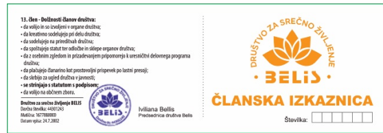
Front page of membership card: