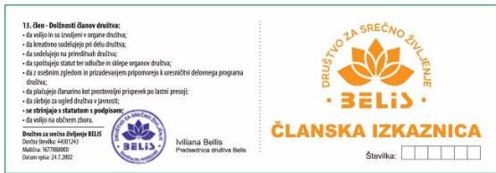
Sprednja stran članske izkaznice: