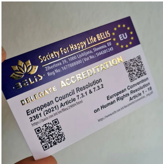
Photo of the front side of the delegate accreditation of a member of the BELIS Society with 3D raised gold printing technology:

Fotografija sprednje strani delegatske akreditacije člana Društva BELIS s tehnologijo 3D dvignjenim zlatim tiskom: