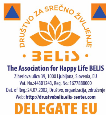
Front page of diplomatic accreditation: