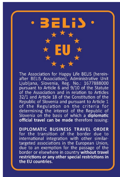
Back page of diplomatic accreditation: