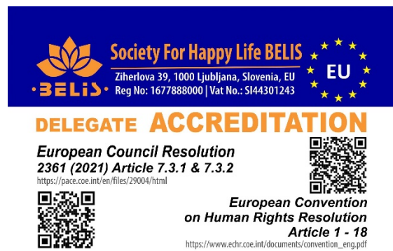
Front page of delegate accreditation: